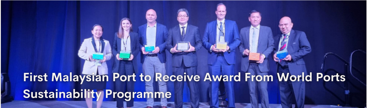
First Malaysian Port to Receive Award From World Ports Sustainability Programme