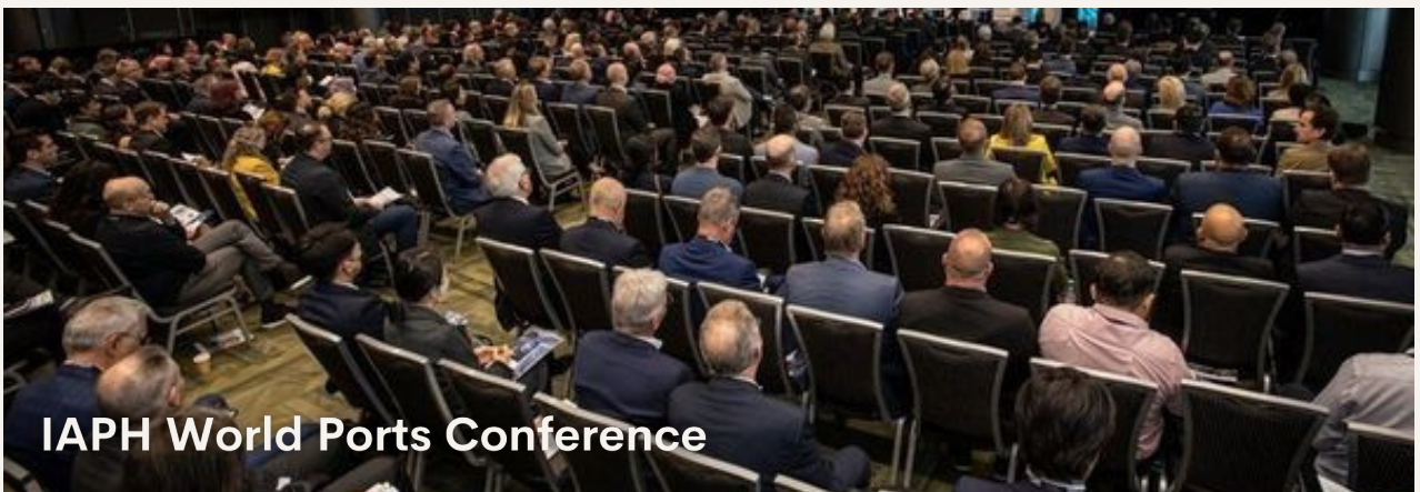
IAPH World Ports Conference