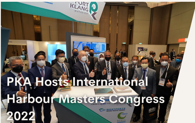
PKA Hosts International Harbour Masters Congress 2022